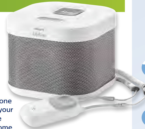
Two systems in one – GoSafe pairs your two-way mobile button with a home communicator.